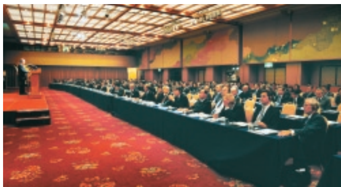
Symposium participants in Tokyo

by representatives from the United States, Germany, France, and Italy, and was followed by a reception and dinner. Abstracts in Japanese of the keynote addresses and subsequent panel discussions were published in the AIJ quarterly magazine Aspen Fellow (No. 18, January 2009).