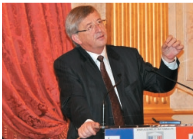
Luxembourg Prime Minister and Eurogroup Chairman Jean-Claude Juncker talks about exercising political leadership at the closing gala dinner for the 2008 class of Young Political Leaders in the Salons de l’Hotel de Lassay, Residence of the President of the National Assembly, Bernard Accoyer, in Paris.

leadership seminar began in the spring. About 30 young elected politicians meet four times a year for a two-day seminar to study ways to be effective in the political sphere. Topics include: how to negotiate, convince, implement reforms, and build credibility. These French-speaking politicians come from France, Belgium, Switzerland, Canada, and Lebanon.