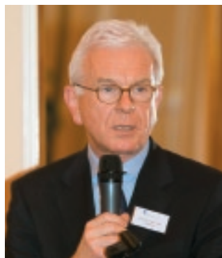
Hans-Gert Pöttering, president of the European Parliament