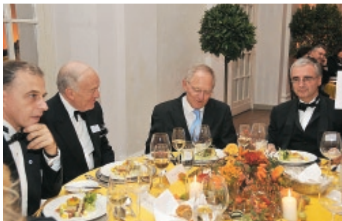
Mircea Geoana, Leonard Lauder, Federal Minister of the Interior Wolfgang Schäuble, and Dr. Paul Achleitner

transatlantic relationship. Aspen Institute President and CEO Walter Isaacson urged a new era of cooperation between the Aspen Institutes in Europe and the United States.