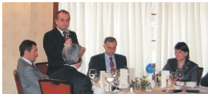
Aspen Romania Working Lunch with the government of Romania, February 2009: Prime Minister Emil Boc addresses the Aspen Romania Members.

1, Herastrau Street Floor 3, Ap. 7, District 1 011981 Bucharest, Romania Tel. + 40 311 024 128 www.aspeninstitute.ro