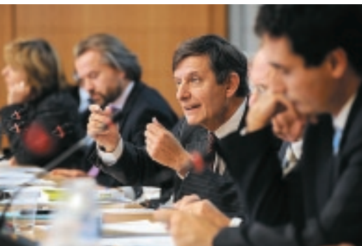
Secretary of State for European Affairs Jean-Pierre Jouyet participating in the Third Forum of European Think Tanks in Paris, September 19–20, 2008.

Institut Aspen France 119, rue Pierre Corneille 69003 Lyon France Tel. + 33 4 72 41 93 12 www.aspenfrance.org