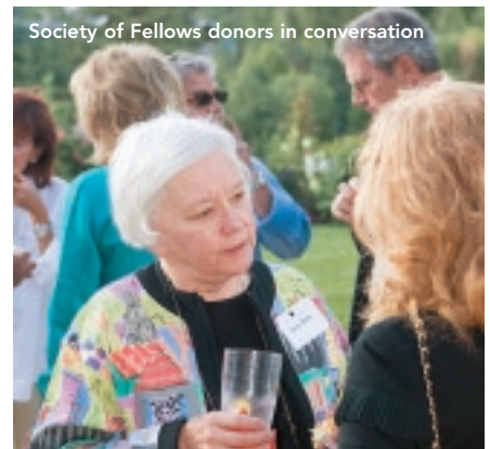
Society of Fellows donors in conversation

Also coming this summer in Aspen are several Evening Discussion Receptions, hosted by Society of Fellows donors in their homes, and luncheons in the Doerr-Hosier Center—each featuring a distinguished guest speaker and allowing ample opportunity for questions and discussion. Institute CEO Walter Isaacson and Harman-Eisner Program Director Dana Gioia will host the opening luncheon June 26.