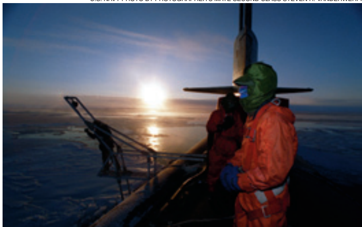
Scientists with U.S. Office of Naval Research study Arctic Ocean currents and their potential effects on the Arctic ice pack.