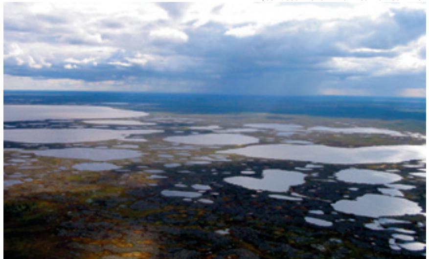
Siberian lakes shrink as the Arctic permafrost beneath them melts.

Greater marine access—earlier and longer navigation seasons—has been achieved throughout the Arctic Ocean, and commercial shipping has steadily increased in Hudson Bay,