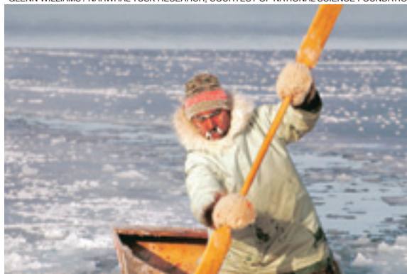
Arctic hunter in Alaska. The future well-being of indigenous Arctic peoples and cultures may be affected by changes in the region's relationship with the rest of the world, suggests author Brigham.

support joint, private–public sponsorship of unique natural reserves. Despite significant transportation and resources development pressures, Arctic national parks have expanded modestly and been adapted to deal with increased tourism.