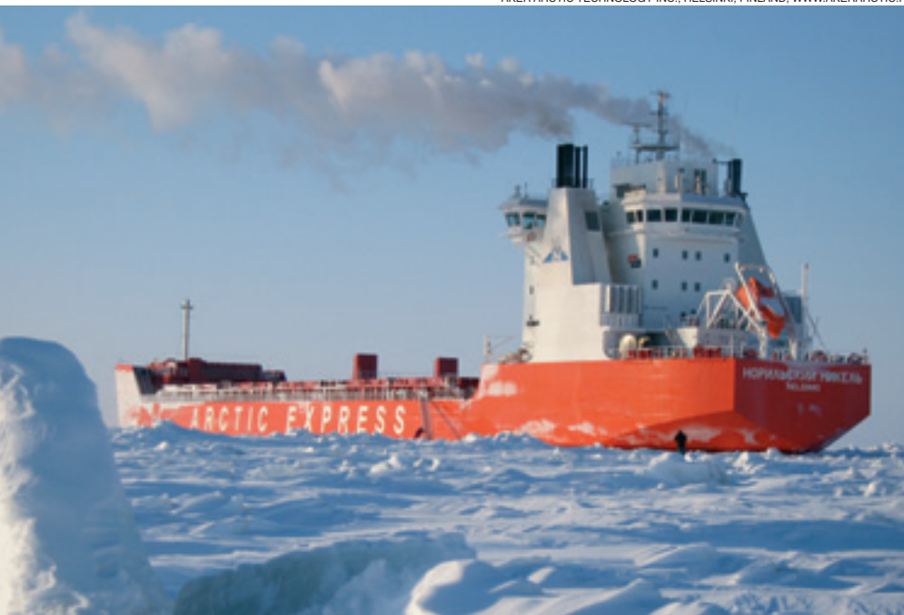
The Arctic Express breaks through ice. The Arctic-going container ship was built by Finland's Aker Arctic Technology Inc. for the Russian mineral company MMC Norilsk Nickel Group. Both transportation and resource exploitation could increase in the future as climate change opens up the Arctic to increased development.

increased royalties by extending mineral rights to commercial firms for seabed tracts in Greenland's exclusive economic zone.