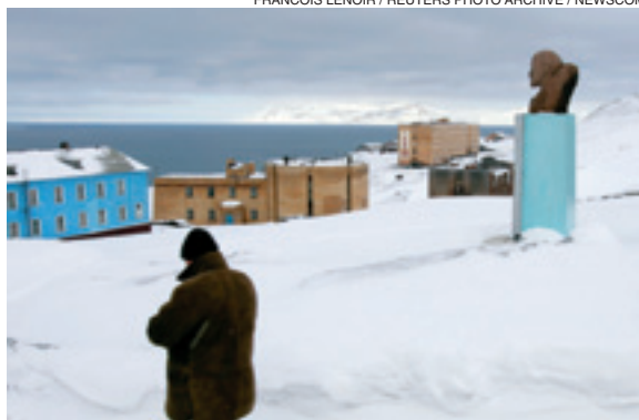
Russian man walks past a bust of Lenin in Svalbard.