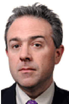
EDWARD LUCE, CHIEF U.S. COLUMNIST FINANCIAL TIMES

Edward Luce was made the FT's chief US commentator in September 2011 with a weekly column and regular editorials on the US economy and politics. Prior to that he was the FT's Washington Bureau Chief from 2006 until 2011 - managing a team of ten DC-based reporters and leading the paper's coverage of US politics and economy. Previously, he was the FT's South Asia bureau chief, based in New Delhi, appointed in 2001. Between 1993 and 1994 he was the Geneva-based correspondent for The Guardian newspaper of the UK. He then moved to Manila to be the Philippines correspondent of the Financial Times between 1995 and 1997. Between 1997 and 1999, he was the Financial Times' capital markets editor, based in London. Between December 1999 and January 2001, Edward was the speechwriter to Larry Summers, Treasury Secretary in the Clinton administration. Edward graduated in politics, philosophy and economics from Oxford University in 1990 and completed a post-graduate diploma in newspaper journalism from City University in London in 1993. His highly-acclaimed book on India: In Spite of the Gods, The Strange Rise of Modern India , was released in the US by Doubleday in 2007. His latest book, Time to Start Thinking America And the Spectre of Descent was published in April 2012. It received a positive NYT cover review and is on a third re-printing.