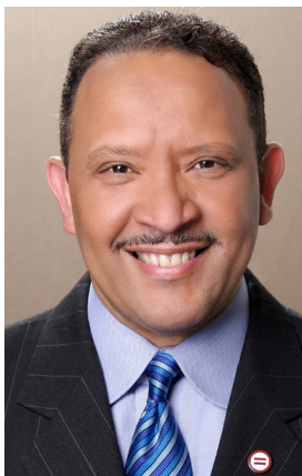
MARC MORIAL, PRESIDENT & CEO NATIONAL URBAN LEAGUE

Entrepreneur. Lawyer. Professor. Legislator. Mayor. President, U.S. Conference of Mayors. CEO of the National Urban League, the nation's largest civil rights organization. In a distinguished professional career that has spanned 25 years, Marc Morial has performed all of these roles with excellence, and is one of the most accomplished servant-leaders in the nation.