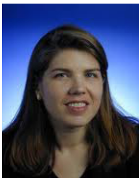
LORI MONTGOMERY, ECONOMIC POLICY REPORTER THE WASHINGTON POST

Lori Montgomery covers U.S. economic policy and the federal budget, focusing on efforts to tame the national debt. She has written extensively about every major piece of legislation to pass Congress since 2008, including the TARP bank bailout, the Obama stimulus package and the Democratic overhaul of the health care system. A former foreign correspondent who covered the emerging economies of Central Europe and the war over Kosovo in the late 1990s, Montgomery joined the Post in 2000 to report on local government and politics. A native of Western Pennsylvania, she has also worked for newspapers in Michigan, Texas and Idaho.