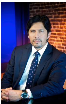
SENATOR KEVIN DE LEÓN CALIFORNIA'S 22ND DISTRICT