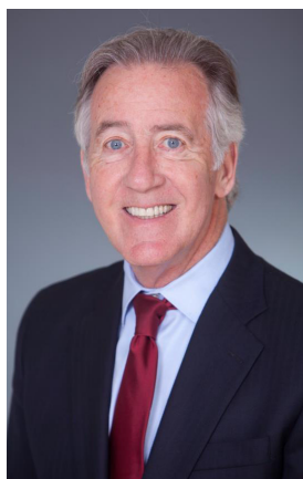
CONGRESSMAN RICHARD NEAL MASSACHUSETTS' 1ST DISTRICT

then worked at the White House from 1994 to 2000, ultimately serving as deputy assistant to President Clinton. She served as deputy director of legislative affairs, managing the legislative staff and acting as a senior White House liaison to Congress. She then served as deputy campaign manager and director of constituency outreach for the Gore/Lieberman presidential campaign. In 2001, Murguía joined the University of Kansas as executive vice chancellor for university relations, overseeing KU's internal and external relations with the public, including governmental and public affairs. Janet Murguía grew up in Kansas City, Kansas. She received three degrees from KU: a BS degree in journalism (1982), a BA degree in Spanish (1982), and a JD degree (1985) from the School of Law. In 2011 she received an honorary degree—Doctor of Humane Letters—from California State University,