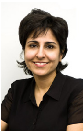
NEERA TANDEN, PRESIDENT & CEO CENTER FOR AMERICAN PROGRESS

changes in the tax law and the principal improvements in tax compliance and administration.” Among other honors, he received Outstanding Alumnus awards from his college and high school and the first Bruce Davie-Albert Davis Public Service Award from the National Tax Association in 2005.