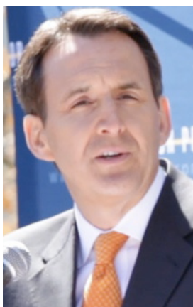
GOVERNOR TIM PAWLENTY, PRESIDENT & CEO FINANCIAL SERVICES ROUNDTABLE

leading teams in the government and public policy sectors. She served in the U.S. Department of Energy in a variety of legislative-oriented positions, and was a special assistant and corresponding secretary to First Lady Nancy Reagan. She holds a B.A. in Foreign Affairs from the University of Virginia.