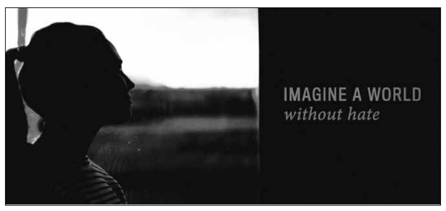
Image from the Imagine a World Without Hate<sup>TM</sup> video and action campaign, celebrating the 100th anniversary of the Anti-Defamation League. http://www.adl.org/imagine.

3) Train staff members about how to create inclusive environments for religious diversity. Whether or not a youth development organization chooses to explicitly address religious diversity as part of its programming, it should ensure that staff members who directly interact with young people are able to create an environment in which all religions are respected and valued. Staff should be trained so they are comfortable with issues of religious diversity. Staff inclusion training should include a focus on religion.