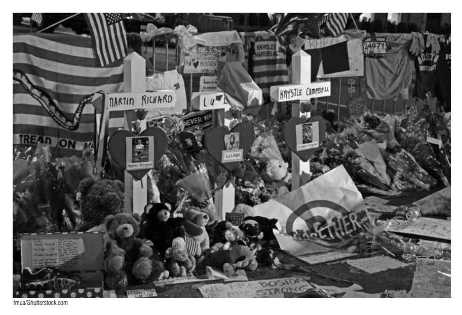
A memorial for the victims of the April 15 Boston Marathon bombing

divided city it was decades ago. We can be proud of the progress that has been made, and we can be hopeful and optimistic about the prospect of further progress, even as we remain vigilant against those who are driven by radical leaders and global unrest to do us harm. Our best response is our inclusiveness. Our strength is in our unity: let us never stop working toward that end.