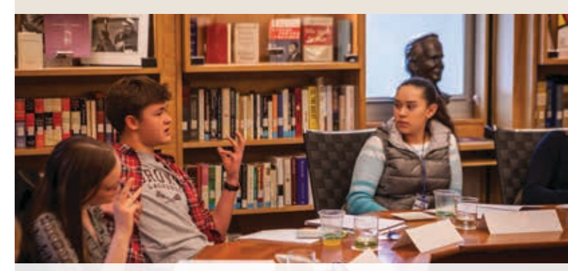
Young people engage around the seminar table at Teen Socrates

We are privileged to have such an esteemed supporter of the Aspen Institute include us alongside her children and grandchildren in her estate plans, as many of our Heritage Society members do. We hope you will consider doing so as well, while perhaps also reaping some tax savings and financial benefits by doing good (and doing well) at the same time.