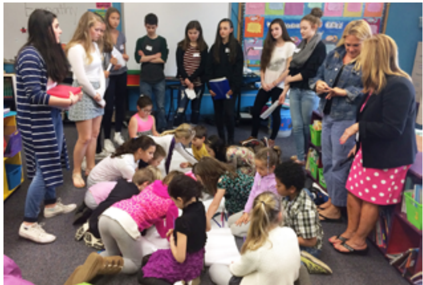
Westbrook High School students teaching second-grade students about empathy.