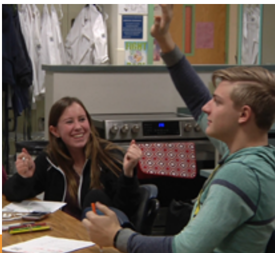
Damonte Ranch High School students engaged in class discussion.