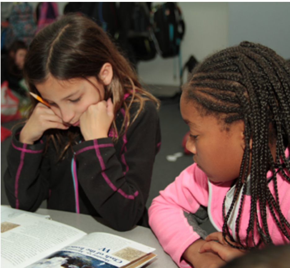
Students at Kellison Elementary School working together in class.

About 75 percent of Kellison students perform at or above the proficiency level on the state's communications test, and nearly 70 percent perform at or above the proficiency level on the state's math test. In 2017, the elementary school ranked better than 80 percent of elementary schools in Missouri on the exams.