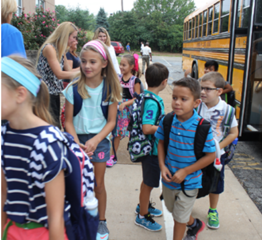
Students are greeted as they enter the building at Kellison Elementary School.