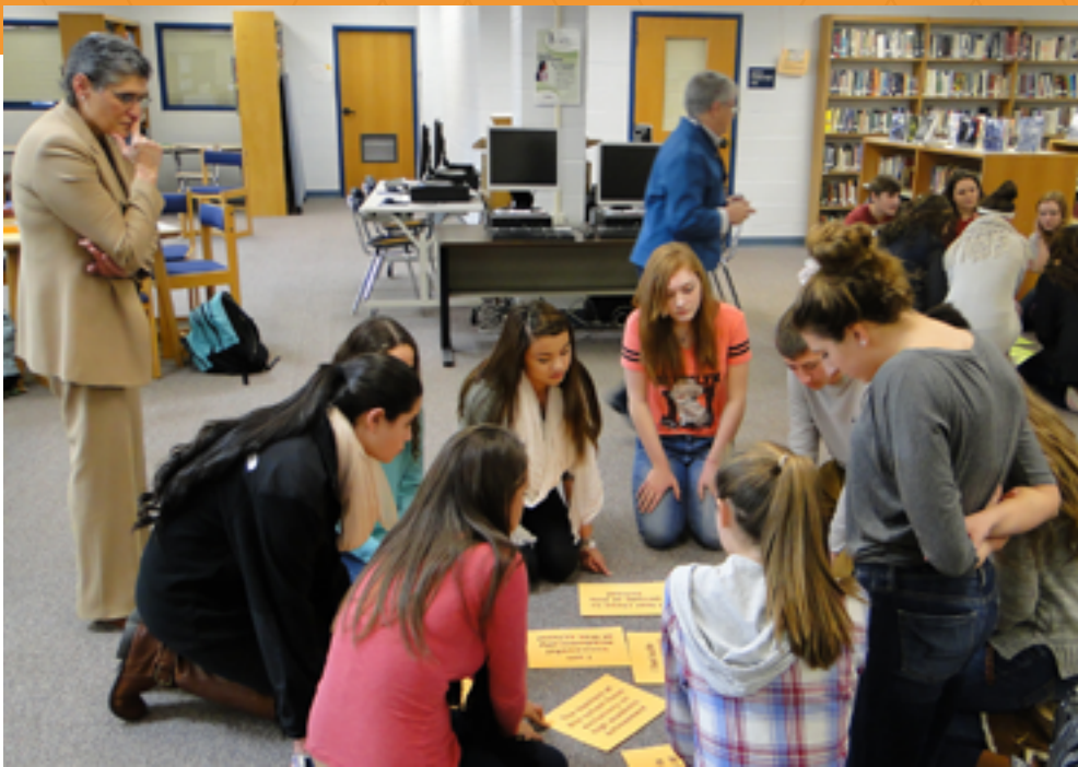
Students engaged in a school climate training session at Westbrook High School.

going to feel comfortable. That's where the social-emotional security comes in."