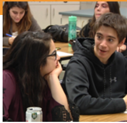
Students collaborating at Damonte Ranch High School.

The 45-minute seminar class meets at the end of every school day. On Wednesdays, teachers teach the social-emotional learning curriculum. So, freshmen might learn about how to build rapport with teachers and productive study habits, while juniors might focus on interview skills and planning for the future. Members of the school's social-emotional learning leadership team—two social-emotional learning coordinators, the assistant principal, the dean of students, and a counselor—observe classrooms on these days. At least one day a week, seminar teachers also check grades and review missing assignments with students.