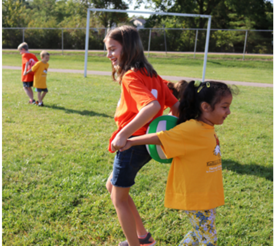
Two students play together as part of the “classroom buddy” program at Kellison Elementary School.

That's because children with strong social and emotional skills are more likely to have good relations with others and engage in learning, while schools characterized by warm and supportive relationships between teachers and students