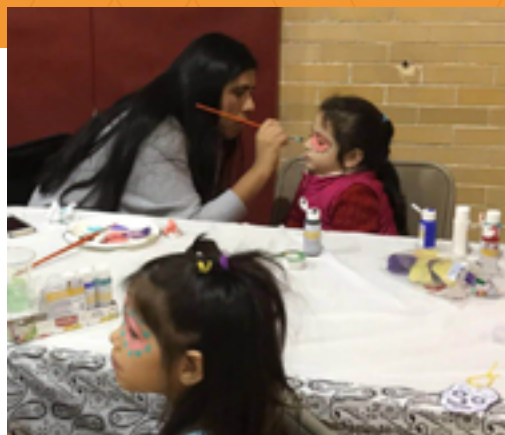
Celebrating Day of the Dead at John Hancock College Preparatory High School.

As part of its whole school transformation model, NCS engages a nonprofit community-based