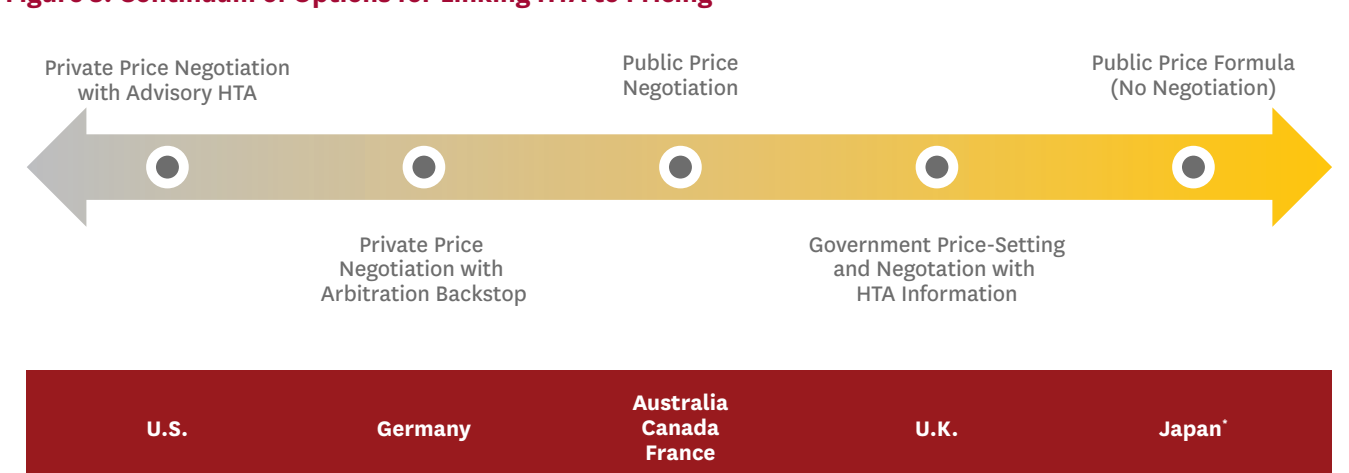
Figure 3: Continuum of Options for Linking HTA to Pricing

Alternative approaches to linking HTA results to pricing decisions could be considered ( Figure 3 ). They range from market-oriented options that allow discretionary price negotiation by payers to more formulaic options that limit pricing discretion by public or private payers. Although an advisory-only system is the most market-oriented approach on the continuum,