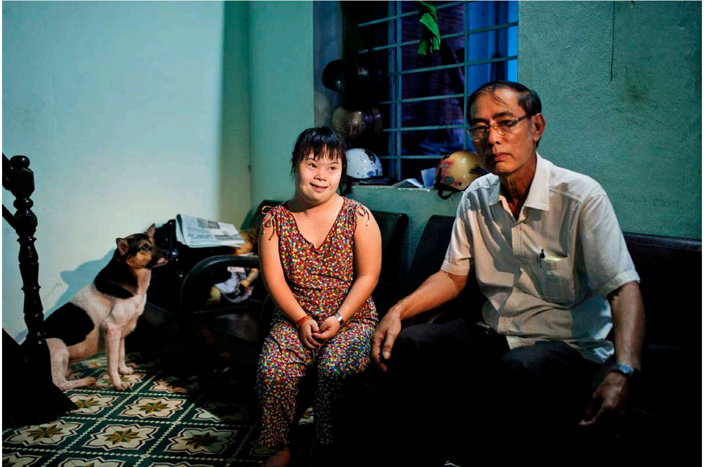
A young woman and her uncle sit in their home in Danang, Vietnam, on August 7, 2012. She was born with physical and mental disabilities that a rehabilitation center's director said were caused by her parents' exposure to Agent Orange.

The “past sins” interpretation causes more distress because it implies misdeeds committed by the individual or their ancestors. In a 2017 study conducted in Thanh Hóa province, several participants reported being subjected to comments such as “Your parents did something wrong, and your children incurred karma,” and “It happened because your parents and family are foolish.” Such condemnations can leave parents feeling guilty and being socially isolated. 17