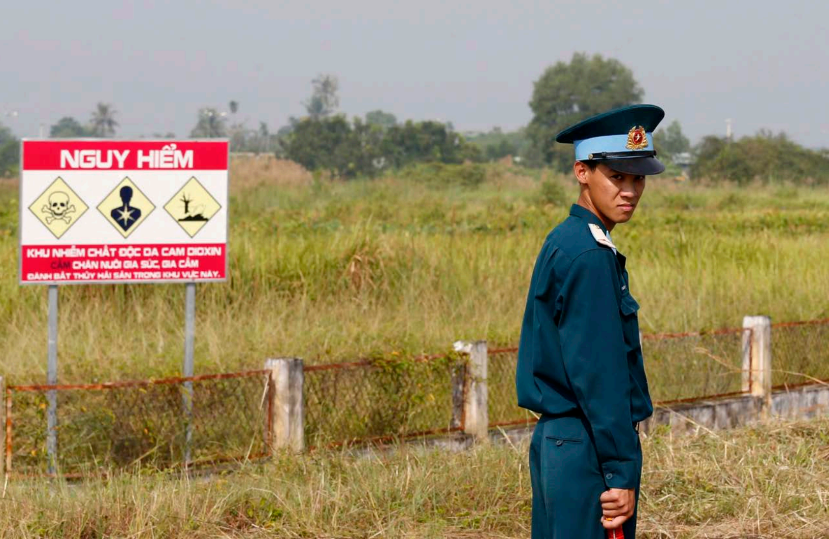
A Vietnamese soldier stands guard at a dioxin-contaminated area at the Biên Hòa Air Base near Ho Chi Minh City during a visit by US Secretary of Defense Jim Mattis on October 17, 2018.