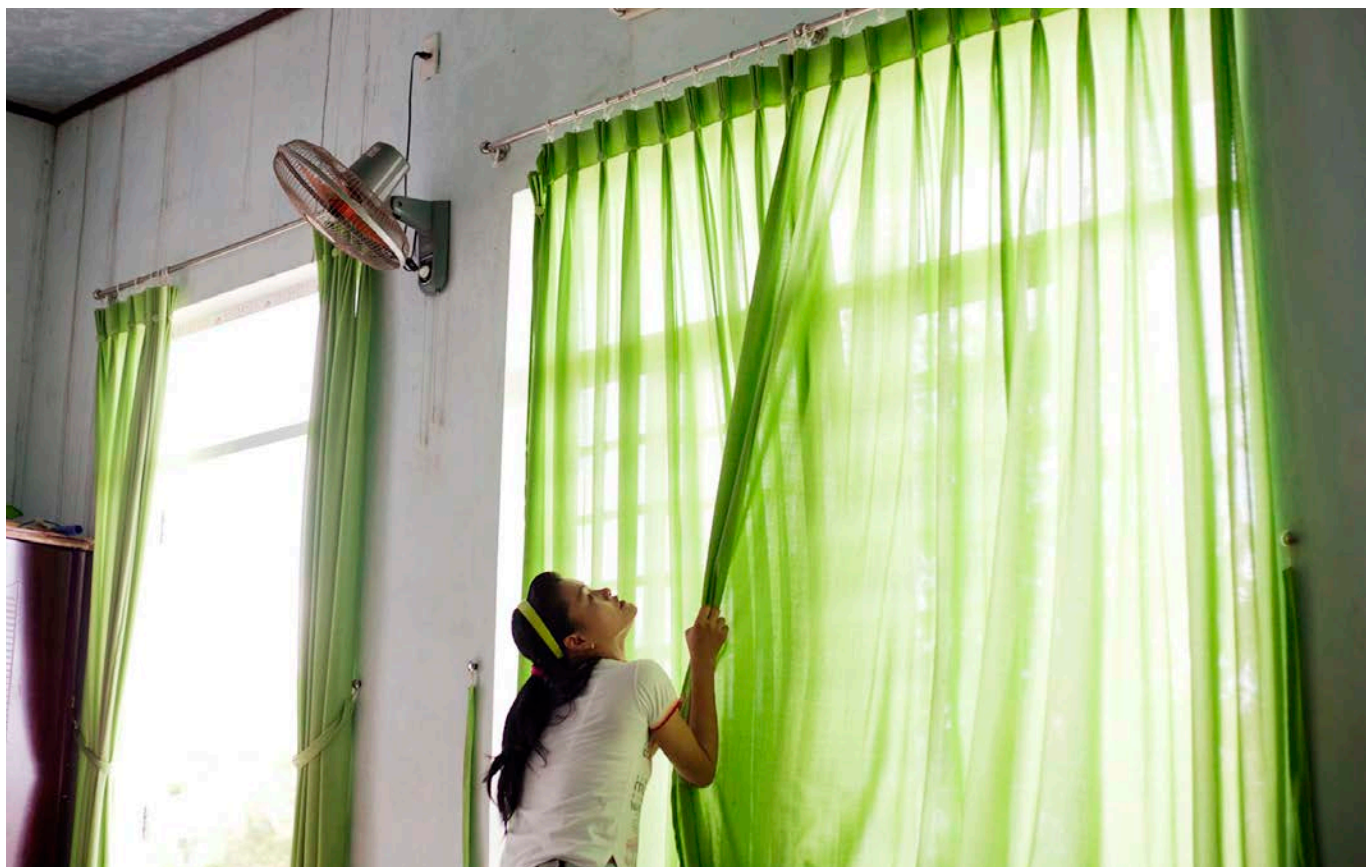
A woman adjusts curtains at a rehabilitation center in Danang, Vietnam, on August 8, 2021, where children with mental and physical disabilities are cared for. The center's director says the children's disabilities were caused by their parents' exposure to dioxin in Agent Orange.

As noted above, VAVA's mission when founded was to seek justice and compensation for Vietnamese nationals affected by Agent Orange. However, the organization's mission has since expanded to include social services and assistance. VAVA affiliates are now present in all of the country's 63 provinces and claim over 400,000 members. VAVA prioritizes meeting the basic needs of victims, such as housing, food, medicine, and wheelchairs. Additionally, it provides physical therapy, rehabilitation, education, and vocational training. To this end, VAVA frequently organizes charitable and philanthropic activities to mobilize assistance for Agent Orange victims and their families at the local and national levels. As of 2020, VAVA chapters at all levels have raised a total of 2.6 trillion dong (nearly $113.7 million) in funds for victims. 42 VAVA also partners with various international organizations, donors, philanthropists, and individuals seeking to contribute to improving the lives of those affected by Agent Orange in Vietnam.