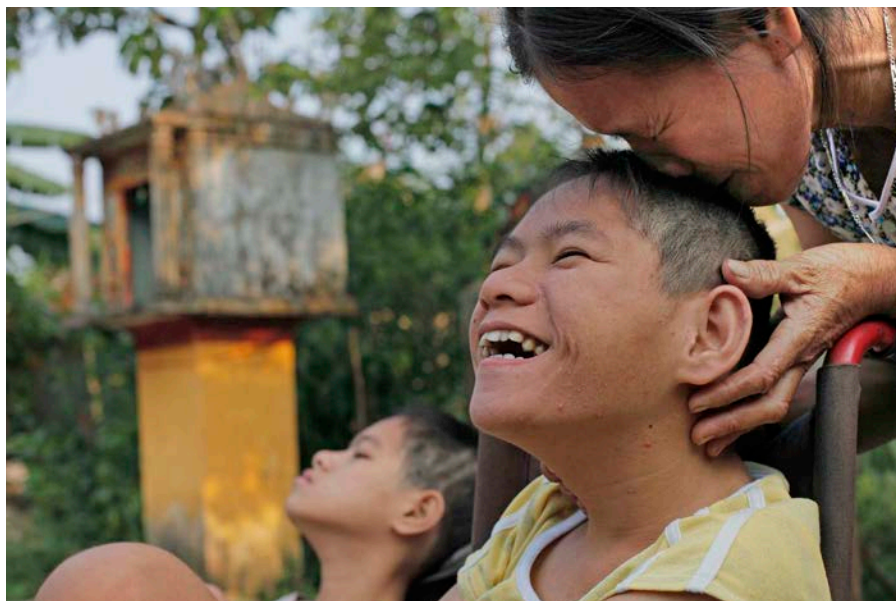
A woman with profound physical and mental disabilities attributed to Agent Orange is pictured on October 5, 2009, in Cam Tuyen, Vietnam.