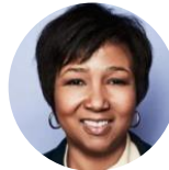
Mae Jemison, M.D. Engineer; physician; former NASA astronaut; and 100 Year Starship (100YSS) project Principal