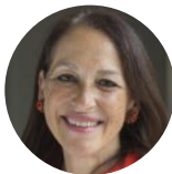
Margaret (Peggy) Hamburg, M.D. Former American Association for the Advancement of Science (AAAS) President and Chair of the Board; and former FDA Commissioner