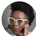
Joy Buolamwini, Ph.D.

President and CEO of Society for Science & the Public and Publisher of its award-winning magazine Science News