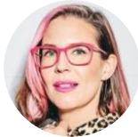
Lauren Gunderson Playwright and author bringing stories of science into the spotlight, currently recognized as America's most produced living playwright