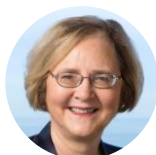
Elizabeth Blackburn, Ph.D. Co-Chair

Molecular biologist; Nobel Laureate in Physiology or Medicine; UCSF Prof. Emerita of Biochemistry and Biophysics; former Salk Institute President