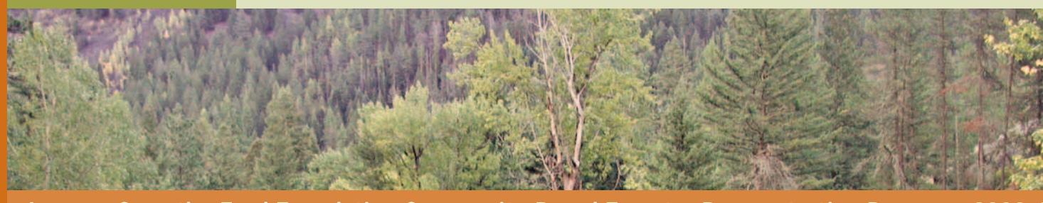
Lessons from the Ford Foundation Community-Based Forestry Demonstration Program, 2000-2