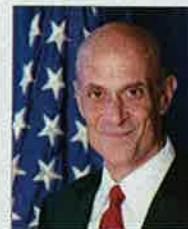
Michael Chertoff Former Secretary of the Department of Homeland Security