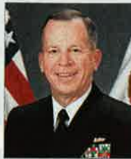
Admiral Mike Mullen Chairman of the Joint Chiefs of Staff