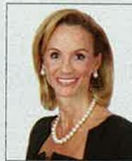
Frances Townsend Former White House Homeland Security and Counterterrorism Adviser