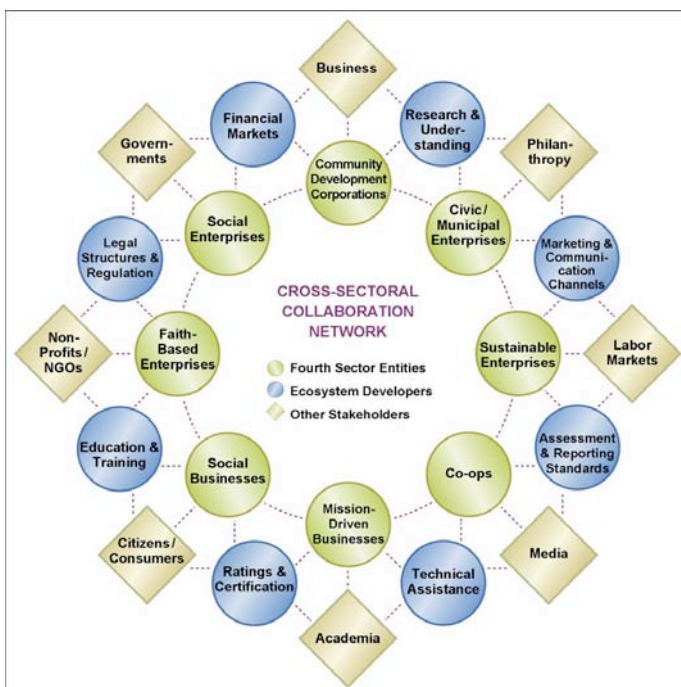
Figure 4. Cross-Sectoral Networks for Collaboration to Accelerate Ecosystem Development

The emerging Fourth Sector is a beacon of possibility in a world in need of hope. It has the potential to address many of the critical systemic challenges we are facing today. There is currently a tension between the will toward emergence and the constraining status quo. By stepping forward individually and collectively, we can take responsibility for our common future and tip the balance in favor of truly transformative and lasting change.