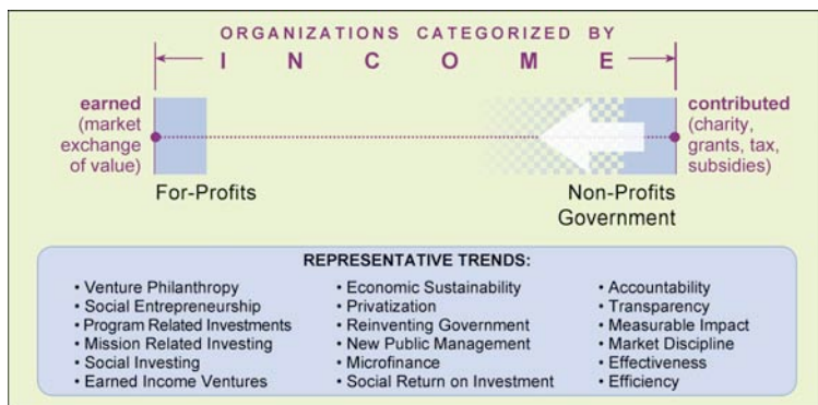
Figure 2. Blurring Boundaries of the Public and Social Sectors