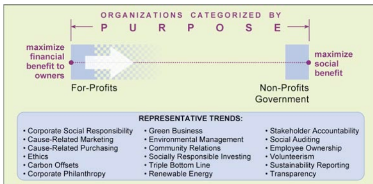
Figure 1. Blurring Boundaries of the Private Sector

At the same time, some governmental and non-profit organizations have become more businesslike, adopting earned-income strategies and a market orientation. Social Entrepreneurship, Mission Related Investing, Municipal Enterprises, and Privatization are examples of these trends (see Figure 2).