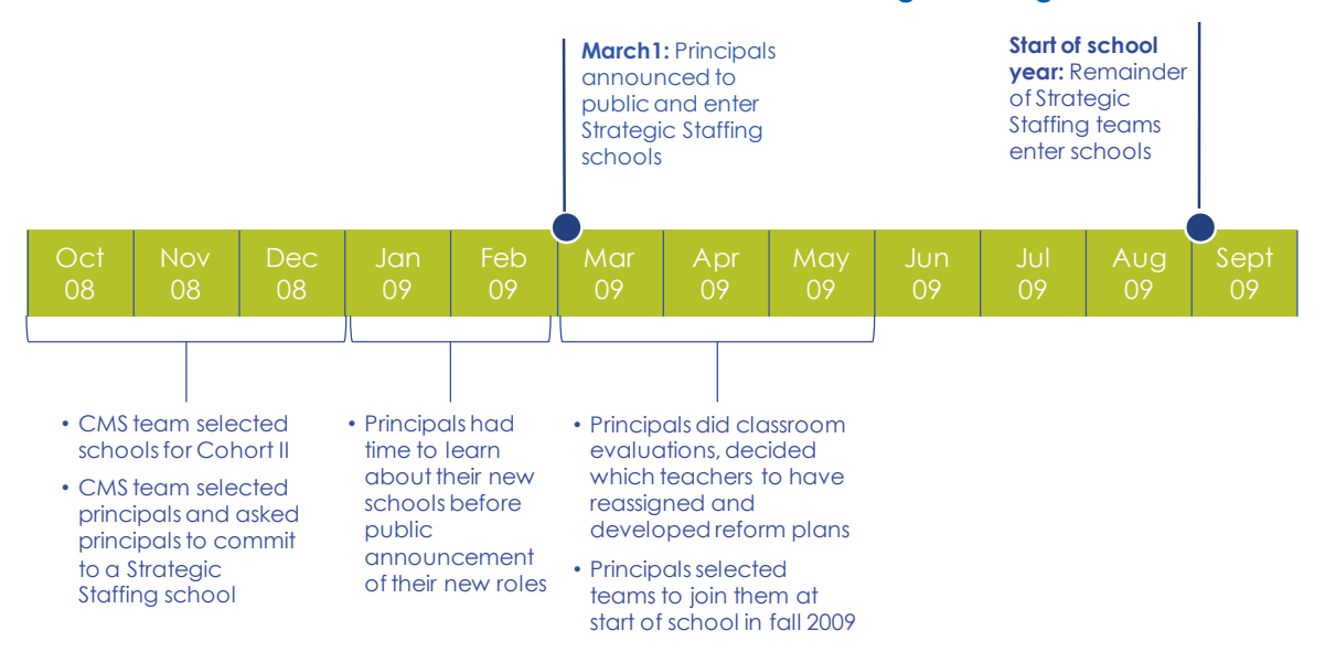
FIGURE 3: Timeline of Selection and Launch for Cohort II of Strategic Staffing Initiative

principals in Cohort I started at their new schools in June 2008, just as the school year was ending, and had little time with school in session to develop an understanding of the school's particular challenges and strengths. Given this timing, Cohort I principals had also been unable to use their own classroom observations as a basis for choosing which teachers to have reassigned. As a result of this feedback, CMS adjusted the timeline so that principals in Cohort II started at their new schools on March 1, 2009. The former principals left the school on the same day; they were either demoted or dismissed. This adjustment to the timing gave the new principal about six months before the start of school to adapt to the school and formulate a reform strategy. The other members of the principals' teams joined their new schools in fall 2009, when schools opened for the new academic year. (See Figure 3 for a visual timeline of Cohort II's selection and introduction to the Strategic Staffing schools.)